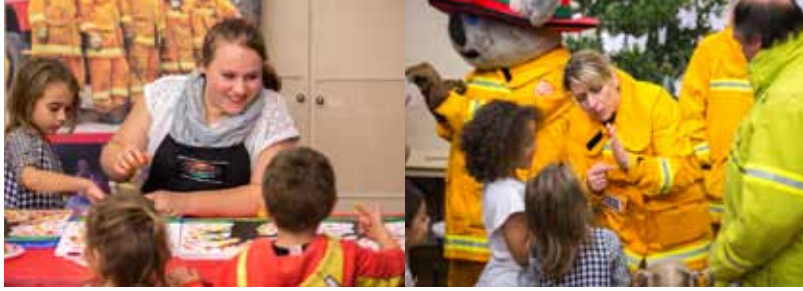
taken at the Koorie Night Market, May 2014