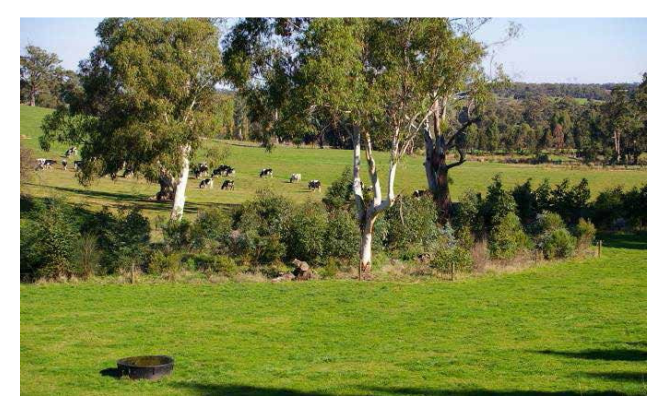
Riparian revegetation and off-stream stock watering.

Hundreds of kilometres of fencing have been erected along Victoria's waterways through the program each year for the last 15 years.