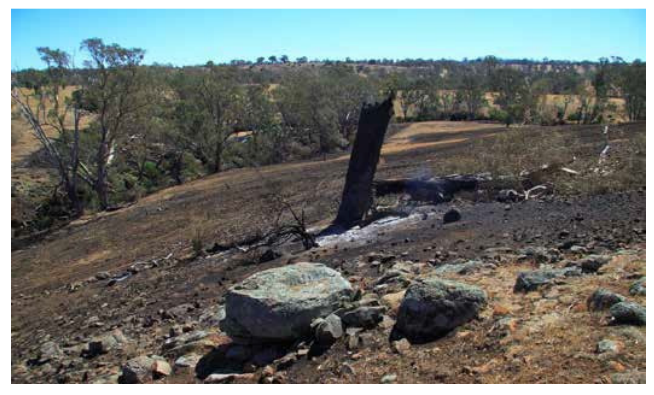
Fire spread in the moister vegetated riparian area was limited compared to the adjacent pasture. Coliban River, Redesdale. Photo taken post February 2009 fire.

Cured pasture that is in close proximity would typically pose a greater threat to built assets (such as houses and farm buildings) than riparian land which is typically further away from assets.