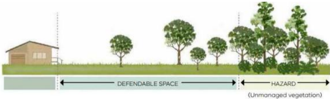
Cross section of defendable space

Defendable space is an area of land around a building where vegetation (fuel) is modified and managed to reduce the effects of flame contact and radiant heat associated with a bushfire. Defendable space is one of the most effective ways of reducing the impact of bushfire on a building.