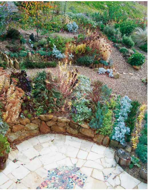
The low garden and slashed grass perimeter provide excellent separation between the house and the bushfire hazard

For instance, local stone provides a strong structural element that links all aspects of the garden visually – and provides non-flammable edging for garden beds.