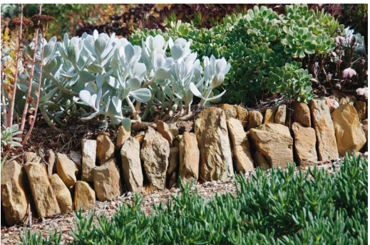
Dense planting of succulents

Keeping the garden low to let light in and to accentuate views reduces bushfire risk by keeping elevated fuel low. It also avoids the risk of vegetation overhanging the house.