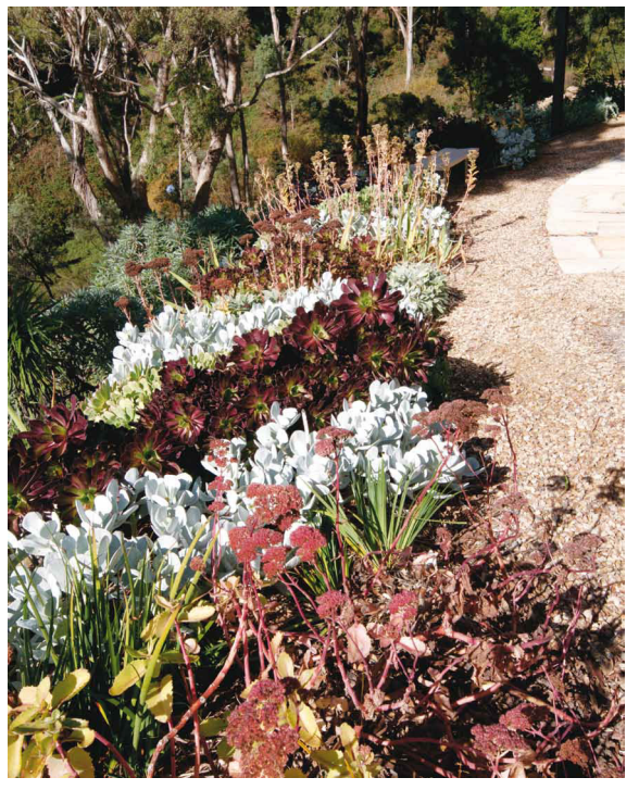
Low plantings allow views through the garden to the surrounding landscape