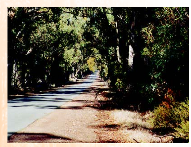
High conservation roadside near Benalla

In a fire, trees, shrubs and tall grasses with large seed heads within 20m of a fire break can provide embers that cross the break (spotting), or under some conditions allow flames to cross the break. Fire breaks that meander through treed or shrub areas are of little benefit.