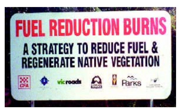
Joint fire safety and native vegetation project near UVilsons Promontory

Under expert advice some roadside fire management works can benefit both the environment and fire control.