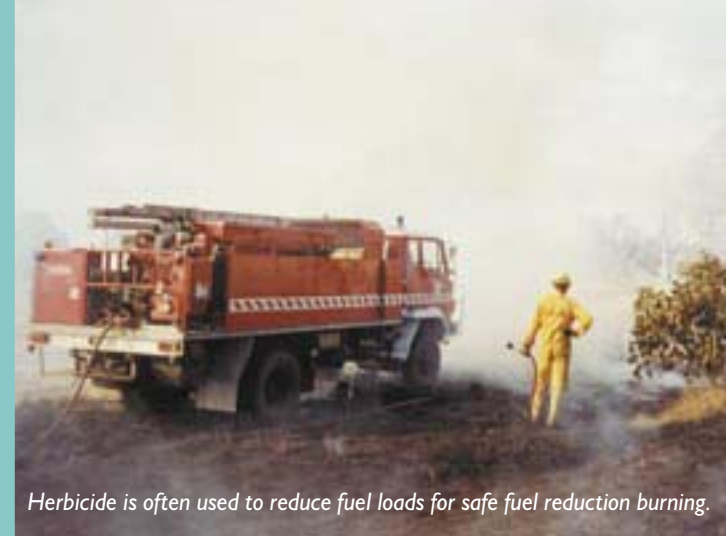
Herbicide is often used to reduce fuel loads for safe fuel reduction burning.