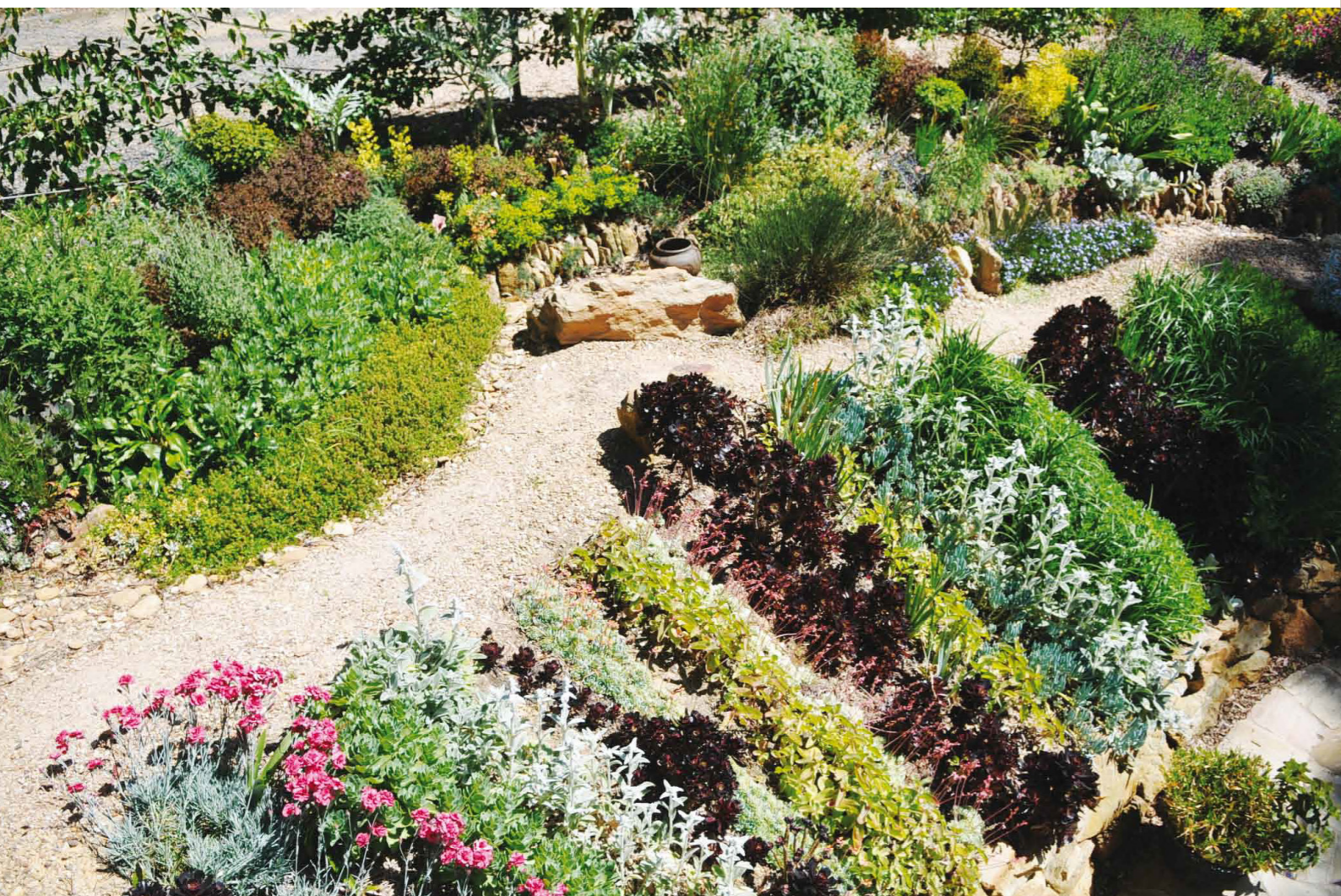
Year-round colour and textural interest in the garden do not compromise the bushfire safety features of the house

For more information about the design principles used in Landscaping for Bushfire or to use CFA's online Plant Selection Key, visit cfa.vic.gov.au/plants or call the VicEmergency Hotline on 1800 226 226