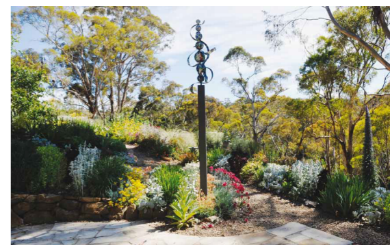
Indian sandstone paving separates the house from the flammable elements in the garden beds

In this fire scenario, there is potential for a fire in the native forest to spread south under northerly winds down a steep gully and then laterally uphill into Sedum and adjoining properties