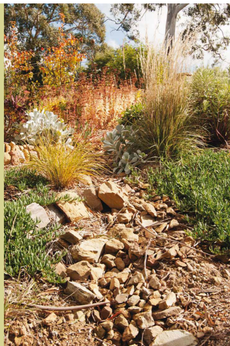
Gravel paths and clever use of local stone