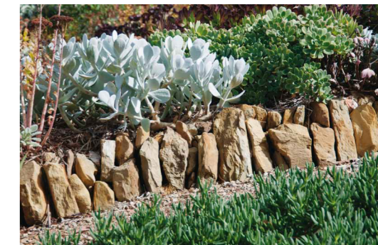
Dense planting of succulents