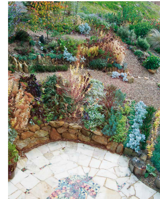
The low garden and slashed grass perimeter provide excellent separation between the house and the bushfire hazard